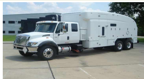
7/32" & 5/16" Cased Hole Split Drum